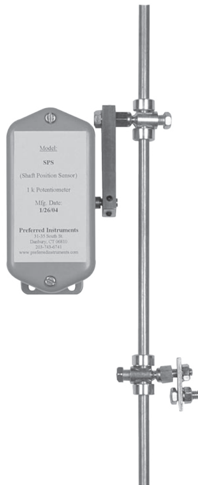
Shaft Position Sensor Model SPS