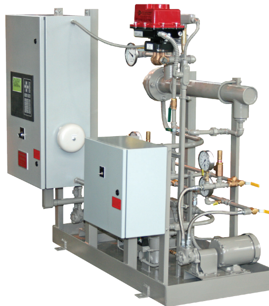
Thermopump Fuel Oil Transfer Pump and Heater Set

The Thermopump system provides the above ground oil storage tank and exposed suction and return lines with a re-circulating flow of warm oil. Additionally, the Thermopump can provide automatic duplex pump sequencing and monitoring for Boiler and day tank applications.