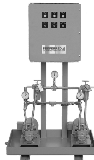
Semi-Automatic Transfer Pump Set